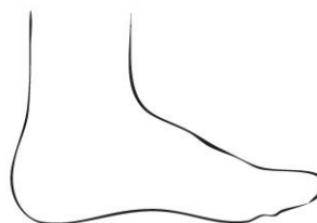
OUTSIDE OF FOOT