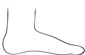
INSIDE OF FOOT