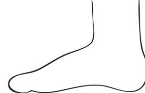
INSIDE OF FOOT