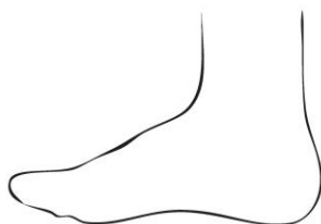
OUTSIDE OF FOOT