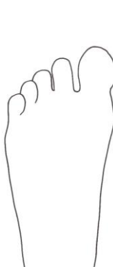
BOTTOM OF FOOT