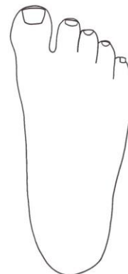
TOP OF FOOT